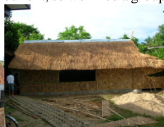
Our New Boy's Dorm

Our boys, like most Akha men, are great with wood, and built a doghouse for Anyi (our puppy) out of bamboo and wood. On their own initiative, they also built a shoe rack and corner shelves for their dorm from leftover wood. Three of our boys went back to their villages for a weekend to join in the traditional Akha Swing Ceremony, held every August in villages. They returned bearing traditional rice-cakes and vegetables from home.